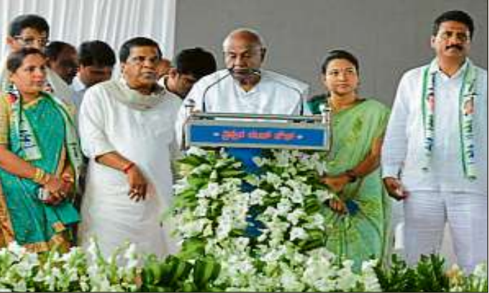
Former prime minister H D Deve Gowda speaks during a campaign for the byelections at Nagamangala, Mandya district, on Thursday.