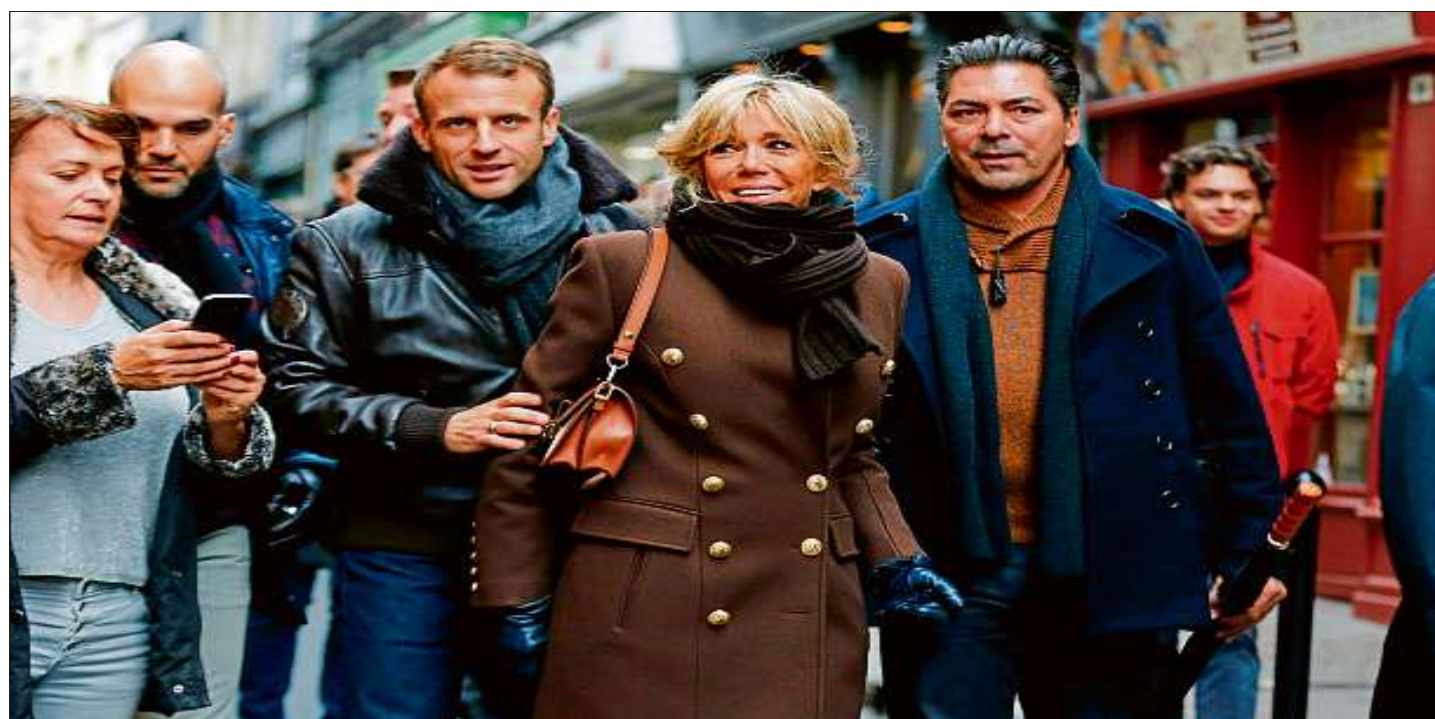
French President Emmanuel Macron and his wife Brigitte Macron walk on the street after leaving a restaurant during their All Saints holidays in Honfleur, northwestern France, on Thursday.