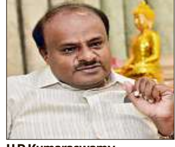
H D Kumaraswamy

"The temple will be built at some point. We are also in favour of it. Ironically, the BJP leaders themselves don't want the temple being built. It wants to continue its di-