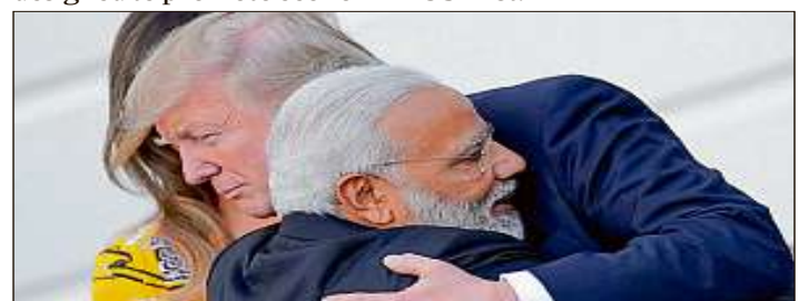
Prime Minister Narendra Modi hugs US President Donald Trump at the White House on June 26, 2017.

"Instead of taking them to a restaurant, Weinstein's driver dropped the two at Weinstein's Soho apartment," the complaint added. She realised the pair were alone, whereupon he began "aggressively and threateningly demanding sex."