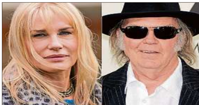
Singer Neil Young, 72, (right) confirmed his marriage to Daryl Hannah, 57, on Wednesday. They were discretely married on July 27, 2018 in Socia Island's Echo Bay.

Kent State University in Ohio. There has been speculation since August that Young, 72, and Hannah, 57, who had been dating since 2014, had married. Earlier this year, Hannah, whose film credits include Blade Runner in 1982 and Splash in 1984, made her debut as a feature film director with Paradox, a playful fantasy Western shot on a shoestring budget and starring Young and fellow musician Willie Nelson.