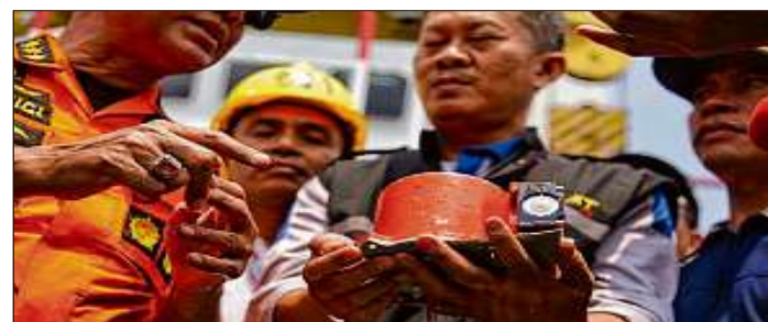
An official holds the black box of Lion Air flight after it was recovered from the Java Sea, off Karawang on Thursday.

There have been no survivors and only body parts have