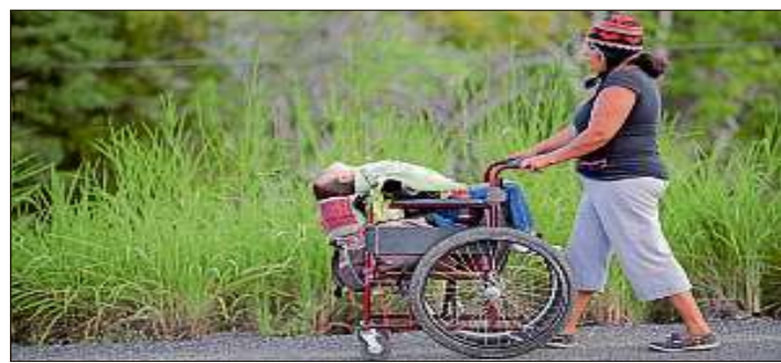
A migrant pushes her son in a wheelchair as along the highway to Juchitan from Santiago Niltepec on Wednesday.

matic citizenship to children born of non-American parents in the US, saying the birthright citizenship "has to end." "Birthright citizenship is a very, very important subject. In my opinion, it's much less complex than people think. I think it says it very loud and clear in the Constitution that you don't have to go through the process of whatever they're talking about," Trump told reporters at the White House on Wednesday.