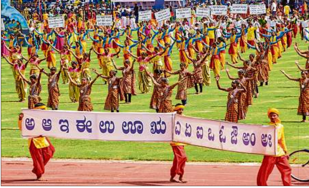
Students perform at the Rajyotsava celebrations in Bengaluru on Thursday.

Noting that many of the youths seeking employment during Janata Darshans, lacked adequate skills and communication ability, he said that the government was taking measures, including English education, to address the issue. While a job mela with the participation of 53 companies was held recently, the government has also decided to set up three skill development varsities, he said. "Our children, especially from rural