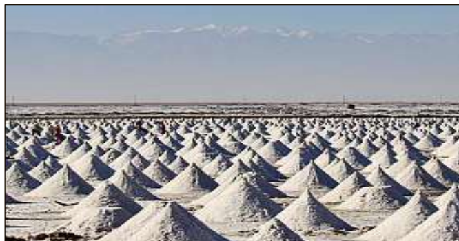
People work among piles of dried crude salt at a salt lake in Zhangye, Gansu province, China on Wednesday.