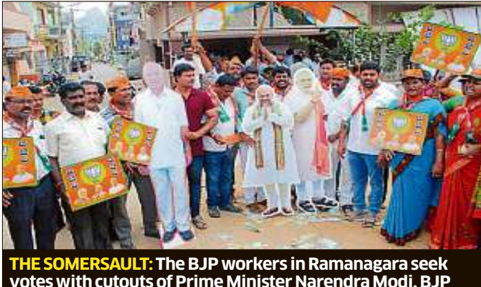
THE SOMERSAULT: The BJP workers in Ramanagara seek votes with cutouts of Prime Minister Narendra Modi, BJP national president Amit Shah and state president B S Yeddyurappa, on Thursday.